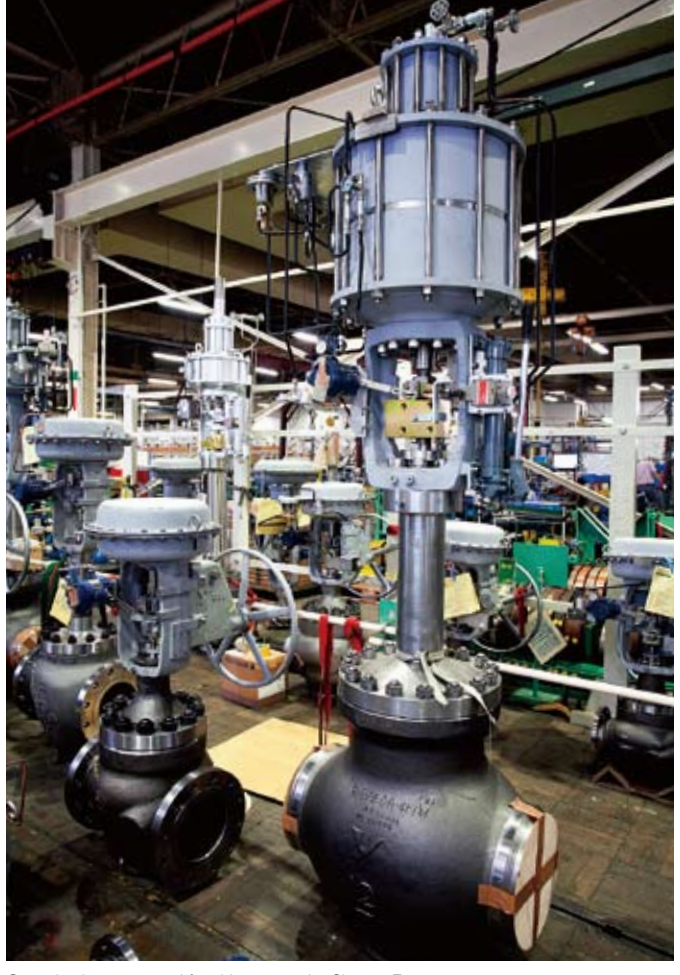
Control valves prepared for shipment at the Shonan Factory. Customization results in various sizes and designs.

Thus, Yamatake enjoys the considerable competitive advantage of providing not only control valves but also the measurement and control systems associated with them, integrated as