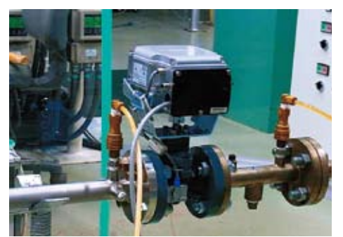
Performance test for ACTIVAL Motorized Two-Way Valve

The valve development section is now working on products equipped