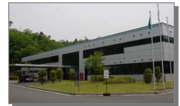
Kimmon Mfg. Kyoto factory

Yamatake will enhance its competitive strengths as a manufacturer by optimizing the Yamatake Group's production structure, including the production facilities and structure of Kimmon Mfg.