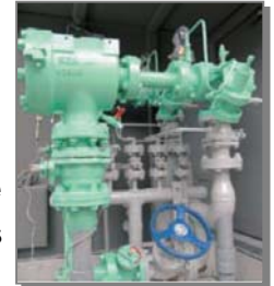
▲ Medium-pressure Meter: CMP series