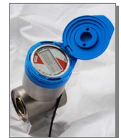
Battery-powered electromagnetic flow meter