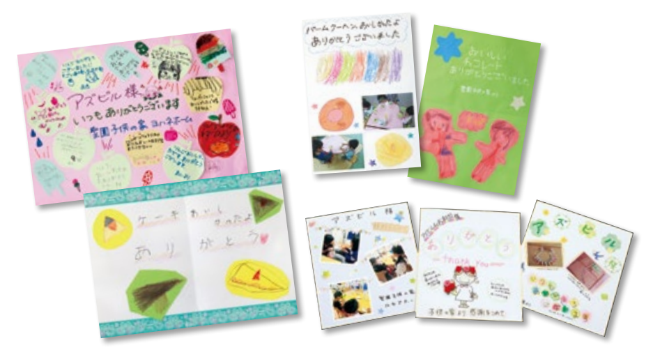
Letters and colored paper given to the Azbil Yamatake General Foundation by the children of Misono Children's House.

education to young people living in the city who for financial reasons have difficulty receiving an education. Donations from the foundation are used as part of the financial resources of Fujisawa's education support fund, which was established to fund the scholarships. In addition, with the aim of supporting the education of children from single-parent families who need financial support, a school support system was established in collaboration with Fujisawa City Hall and the Fujisawa Social Welfare Council. The foundation provides support funds for children who go on to junior high school or high school, or who graduate from junior high school and find employment.